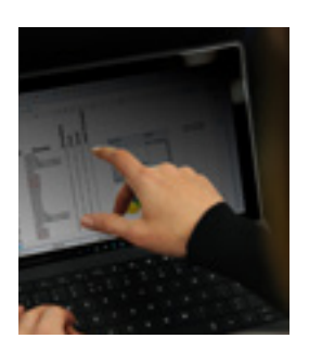
Available across a range of devices