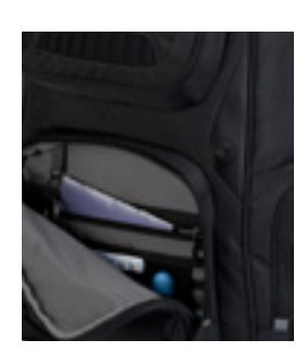
Easy access pockets