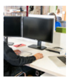
Create a Dual Screen Workspace