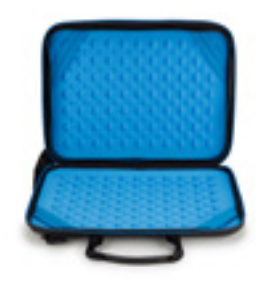
Diamond dual layer protection system