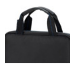
Digi-pass or USB stick pocket