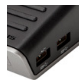
Connect to all your peripherals via USB 3.0