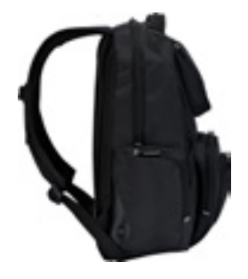
Padded & ventilated shoulder straps and back panel