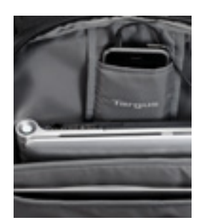
Padded laptop or tablet compartments