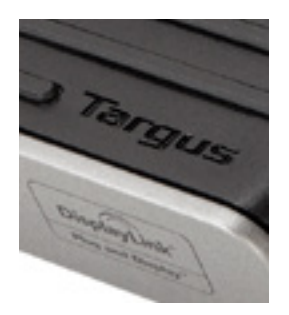
Cross platform compatible