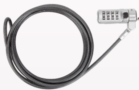
ASP66GLX-25S | DEFCON® Trapezoid Serialized Combo Cable Lock – 25 pack*