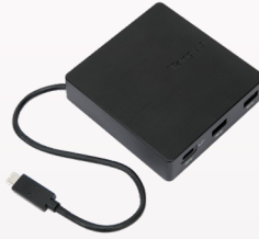
DOCK412USZ | USB-C™ Travel Dock with Power Pass-Through up to 60W