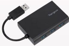
ACH122USZ | USB 3.0 3-Port Hub with Ethernet

in airports, conference rooms, or in the field with their clients – device protection and connectivity is key. Worry about your presentations, not your technology with some of our recommended solutions.