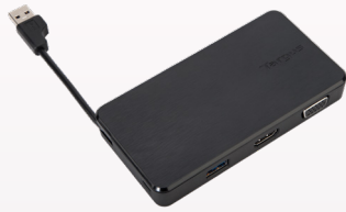
DOCK110USZ | VersaLink™ Universal Travel Dock, USB 3.0, Single 2K or Dual HD Video