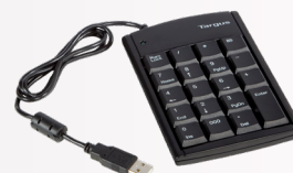
PAUK10U | Numeric Keypad with USB Hub

WHETHER YOUR OFFICE PRACTICES HOTELING, HOT-DESKING, or assigned seating, let us help you choose the right accessories for your workspace and set you and your employees up for greater efficiencies and productivity.