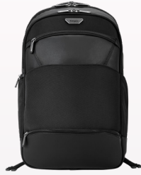
PSB862 | 15.6" Mobile ViP Backpack 🛡️ + LOGO