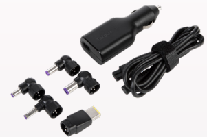
APD33US | 90W DC Universal Laptop Car Charger