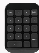
AKP11US | Wireless Numeric Keypad