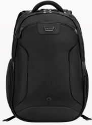
CUCT02B | 16" Corporate Traveler Backpack ✈️ + LOGO