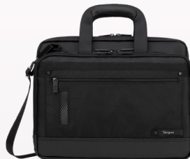
TTL416US | 16" Revolution Briefcase ✈️ 🛡️ + LOGO