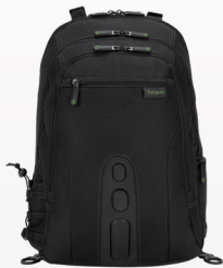
TBB013US | 15.6" Spruce™ EcoSmart® Backpack ✈️ + LOGO

✈️ Checkpoint-Friendly D3O 2 SafePort® x D30® Impact Protection 🛡️ SafePort® Sling Protection 📶 DOME Shock Dispersion + LOGO Logoable