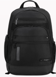
TEB005US | 15.6" Revolution Backpack ✈️ 🛡️ + LOGO