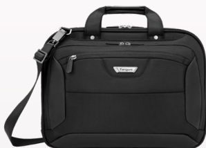
CUCT02UA14S | 14" Corporate Traveler Briefcase ✈️ D3O 2 + LOGO