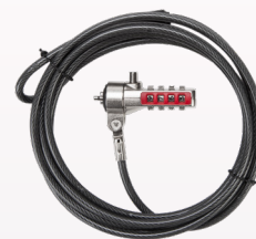
PA410S-25 | DEFCON® T-Lock Serialized Combo Cable Lock – 25 pack*