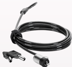
ASP48MKUSX-25 | DEFCON® T-Lock Master Keyed Cable Lock – 25 pack*