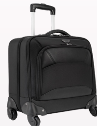
PBR022 | 15.6" Mobile ViP 4-Wheel Overnight Roller + LOGO