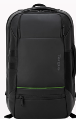
TSB921US | 15.6" Balance™ EcoSmart® Backpack ✈️ 🛡️ + LOGO