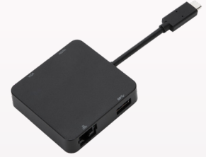
DOCK411USZ | USB-C™ DisplayPort™ Alt-Mode Travel Dock