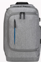
TSB939GL | 15.6" CityLite Pro Premium Backpack 📶