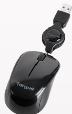
AMU75US | Compact BlueTrace Mouse