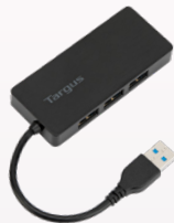
ACH124US | USB 3.0 4-Port Hub